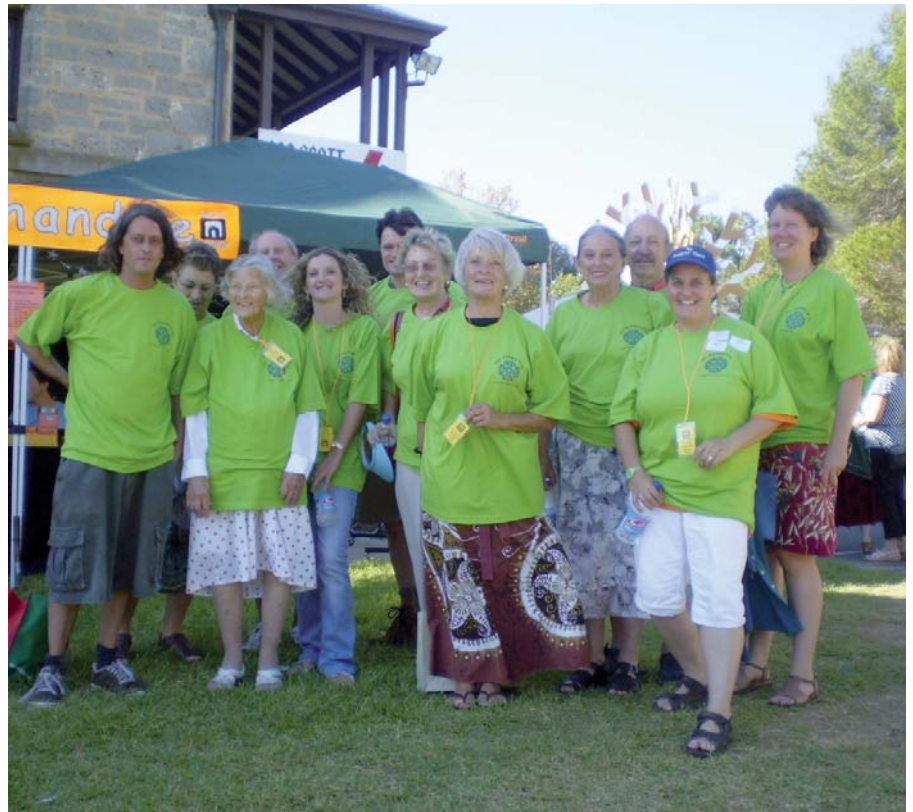
St Pat's Starlight Hotel Choir was a crowd pleaser.

nerves but nothing could match the passion of their performance and the magical atmosphere that they projected out to the crowd.