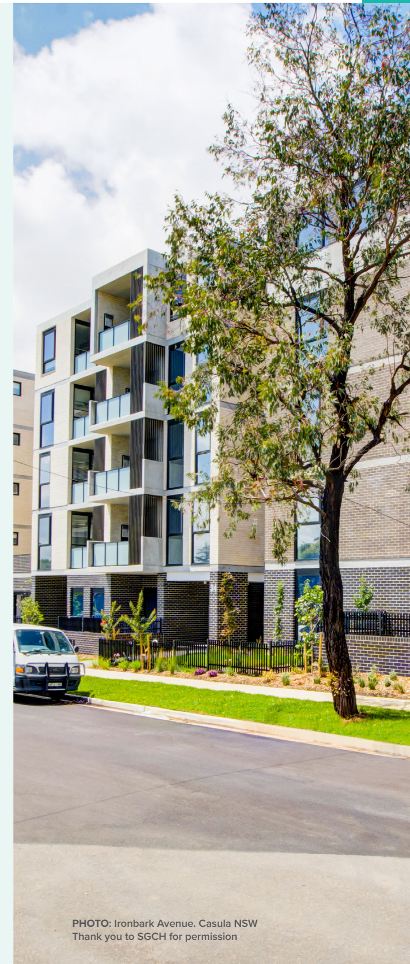
PHOTO: Ironbark Avenue, Casula NSW Thank you to SGCH for permission