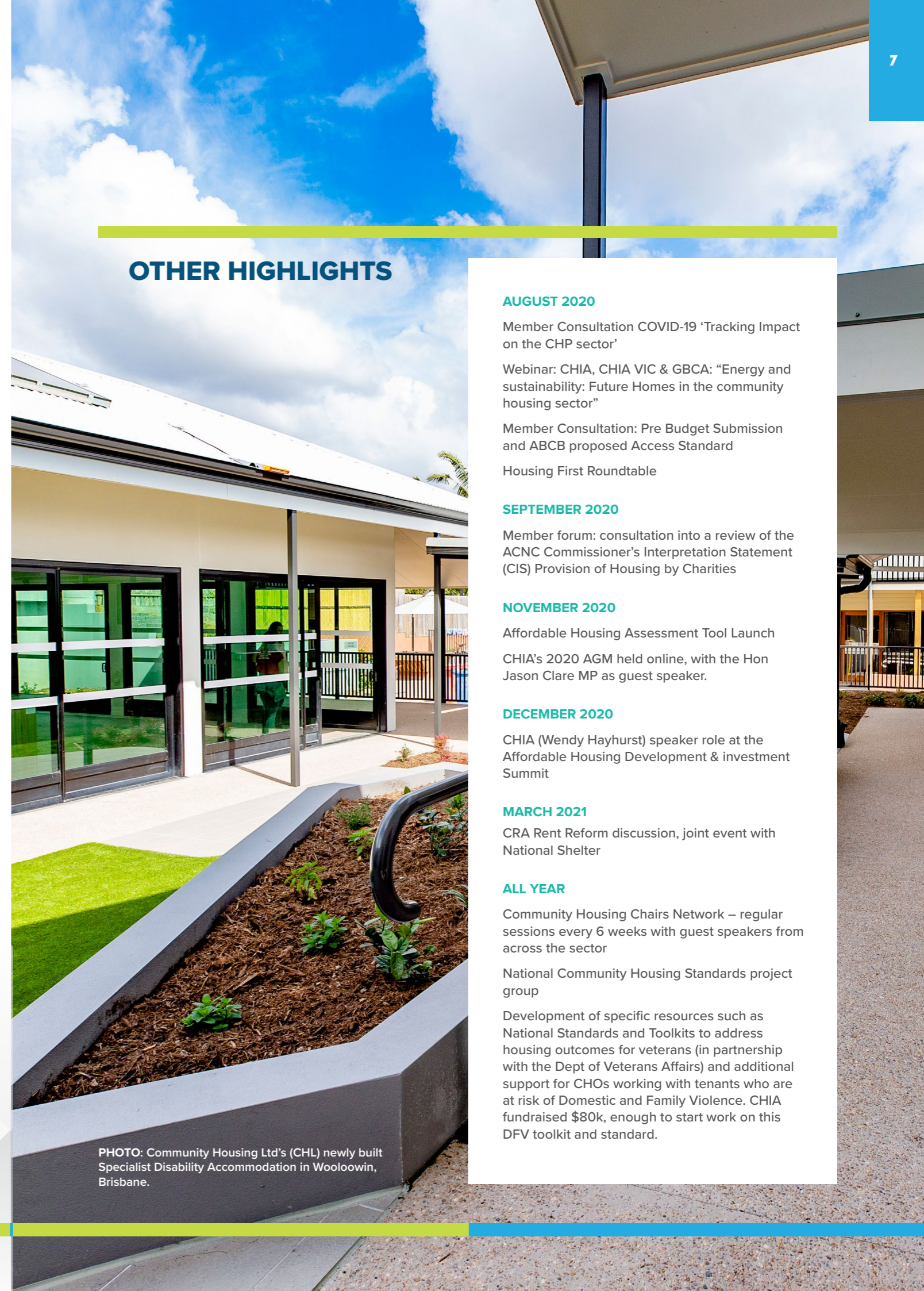
PHOTO: Community Housing Ltd's (CHL) newly built Specialist Disability Accommodation in Woolloowin, Brisbane.

Development of specific resources such as National Standards and Toolkits to address housing outcomes for veterans (in partnership with the Dept of Veterans Affairs) and additional support for CHOs working with tenants who are at risk of Domestic and Family Violence. CHIA fundraised $80k, enough to start work on this DFV toolkit and standard.