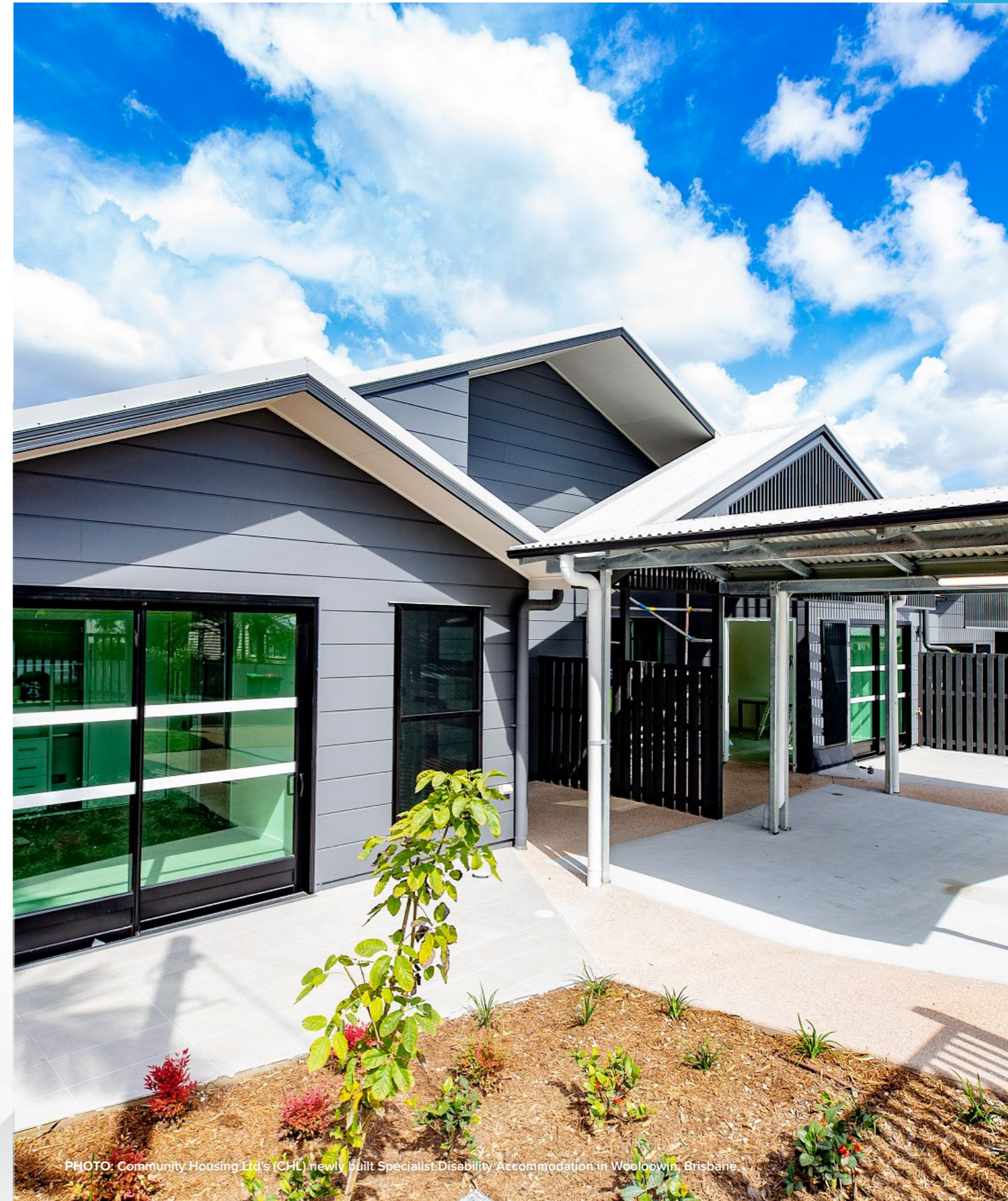
PHOTO: Community Housing Ltd's (CHL) newly built Specialist Disability Accommodation in Woolloowin, Brisbane