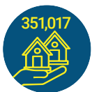
SOCIAL HOUSING DWELLINGS AUSTRALIA, 2021

Swinburne University's Centre for Urban Transitions calculates the affordable and social housing shortfall will cost the economy $1.286 billion in lost social and economic benefits by 2036. The Australian Housing and Urban Research Institute (AHURI) says an additional 727,300 social housing dwellings are required by the same year. It is time to invest in this essential social infrastructure.