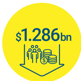
SOCIAL AND ECONOMIC BENEFITS LOST BY 2036