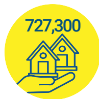
ADDITIONAL SOCIAL HOUSING REQUIRED BY 2036