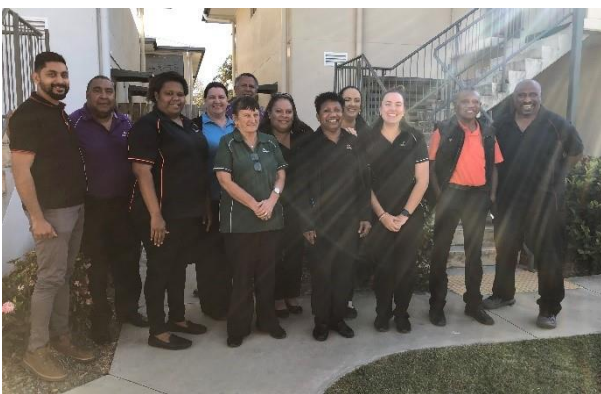
Conversations for Outcomes Participants from Yumba-Meta in Townsville

Unfortunately COVID-19 restrictions affected the take-up and delivery of the units and some participants were challenged by the mixed-mode delivery, low network speeds and limited bandwidth. The overall feedback was positive with the online content rated as high quality and the groups appreciating the opportunity to reflect on their work and learning from each other.