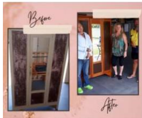
MCHC Men's Group furniture restoration program donation to Lifeline Mareeba 2023