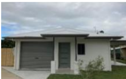
Mason Street Mareeba unit completed July 2022 partnership MCHC and Dept Housing

MCHC Men's group has been busy in 2023 with their furniture restoration program completing several projects with products and donations from local stores, the wardrobe delivered to Lifeline a tribute to them all. Life skills, personal development and growth within the group is evident with number of participants obtaining full time employment this year.