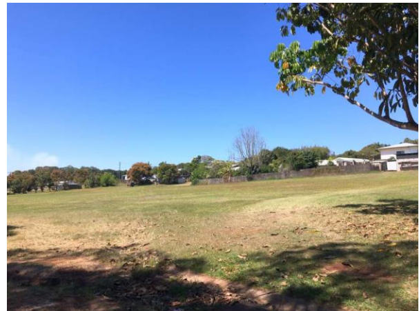
Kelly Street, Atherton - 8 x 1 bedroom units for women over 60. Expected completion date - end of 2024.

Tenants are also welcomed to the office to receive support in their personal lives e.g., bereavement, mental health issues, as well as celebrations they want to share.