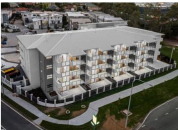
Brookvale Drive, Underwood Affordable Housing Units

NAH has been finalising the acquisition of an inner-city office block for conversion to social housing and commenced its preparations for its new community housing services model, including readiness to pilot Personal Housing Plans with eligible residents.