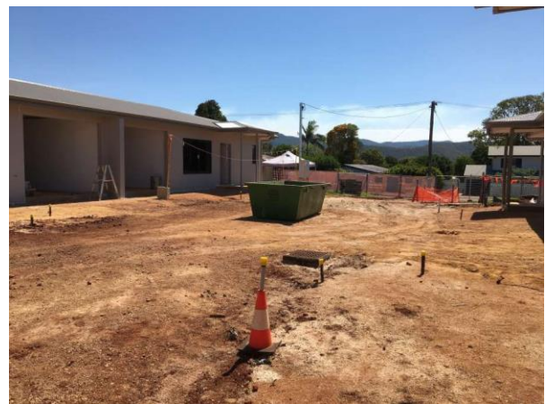
McConnell Street, Atherton. Expected completion date - end of November 2023.