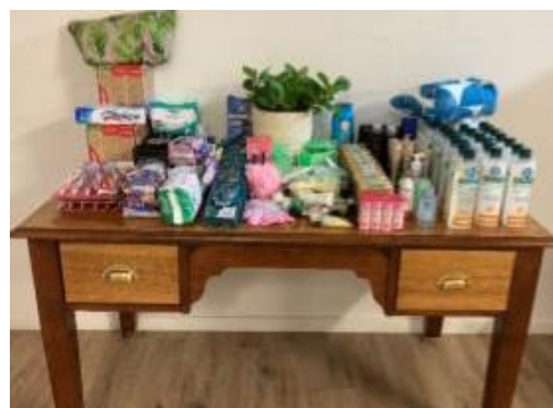
Hungry Pug Mareeba personal pack donations – Homeless Week 2023