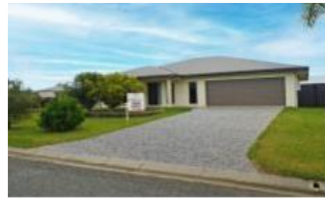
Sunbird Parade Mareeba house purchased September 2022 QHIGI Grant