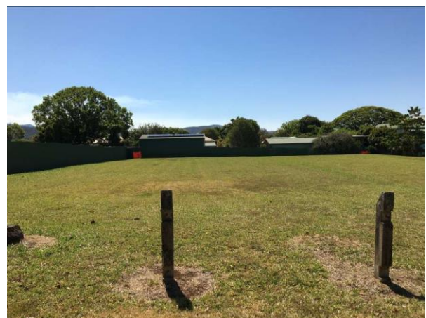
Victoria Street, Atherton - 10 x 2 bedroom units Expected completion date - end of 2024