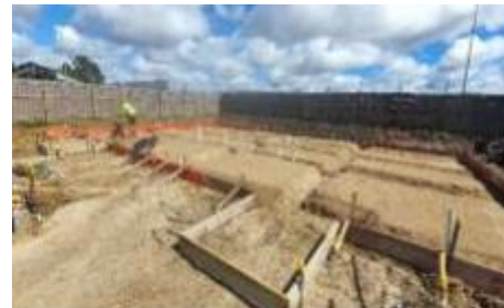
Strattman Street Mareeba 5 unit complex due for completion November 2023